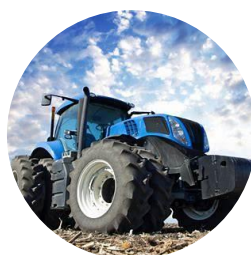
Food & Agriculture

Fund outperformance of global equities over more than 9 years.