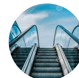
Cities & Infrastructure